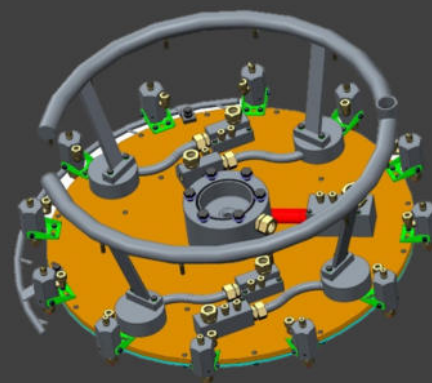
Spray head for railway wheels